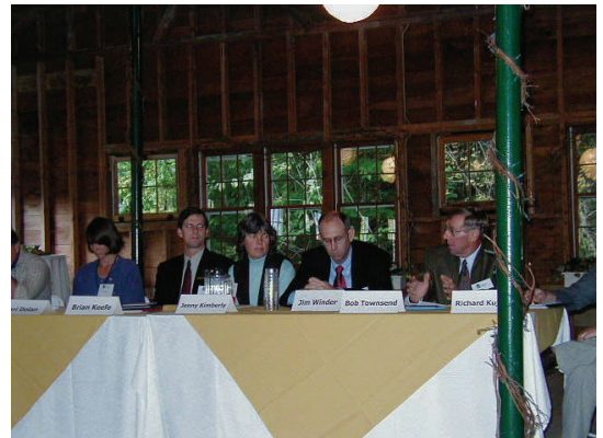
Panel discussion at September forum

That issue was taken up at a November meeting in Shushan, NY, where 28 people — some from as far away as Ray Brook and Cortland, New York and Essex Junction, Vermont, others from as nearby as