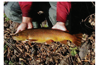
20+” Batten Kill brown, Fall 2000

The team is also considering other study proposals, including pesticide sampling and analyses, evaluating river flows and patterns over the years, and resumption of creel survey. As these activities wrap up and the data are analyzed, results for each activity will be presented in a report or white paper. The first of these will be completed by the end of the year. Lastly, it merits mentioning that all of this work would be nearly impossible without the involvement and cooperation of state and federal natural resource agencies (Vermont Agency of Natural Resources, U.S. Forest Service-Green Mountain Forest), and the support of private conservation groups (such as Trout Unlimited), and concerned and actively involved citizens.