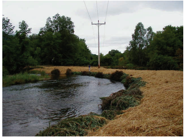
Tree revetments at Wilburs' Bridge site

If you are interested in volunteering time and making an important contribution to the river, you should meet on April 28 at 9:00 AM in the parking area by the Route 313 bridge and Arlington Recreation Area. Volunteers will be divided between two teams to travel to either the Manchester site or Arlington site. Please dress accordingly