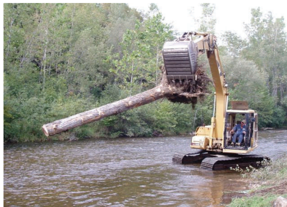
Sand bank stabilization in Manchester.