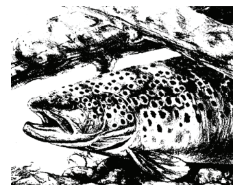
Illustration by Mike Stidham