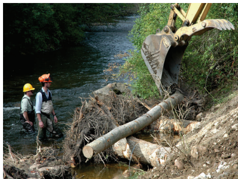
Fish cover habitat construction in Manchester.

base of the slide as well as several large woody debris clusters to increase trout cover within the project site. The river bank opposite the slide is owned by the Orvis Company and was planted with 30 trees.