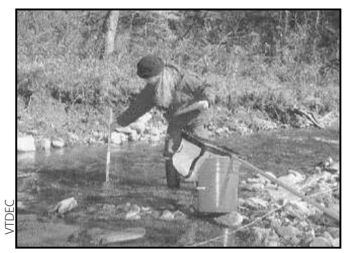
Water quality monitoring by local watershed groups is one of the many projects supported by Conservation License Plate sales.

More information about the Conservation Plate and an application can be found on the Fish & Wildlife website: www.vtfishandwildlife.com. Simply click on the "GoWild" license plate on the home page.