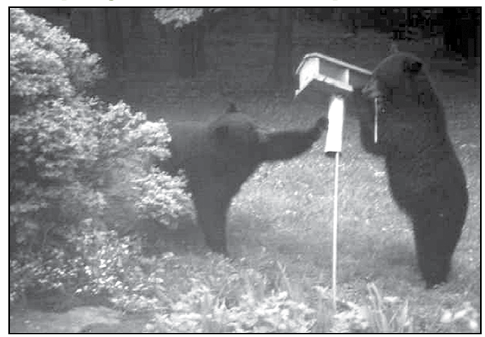
Bird feeders, barbecue grills, garbage, and dirty campsites are appealing but potentially deadly food sources for black bears.

any Vermonters would be thrilled to see a black bear. But having one on their back porch is too close.