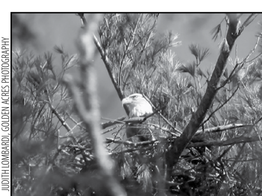
In April 2006, a pair of bald eagles successfully hatch a young eagle in a nest they built the previous year. This was first confirmed sucessful nesting in 60 years.

successfully hatched young in a nest they built last year on the Vermont side of the Connecticut River. This was the first pair to hatch young in Vermont in 60 years. Unfortunately the young eaglet did not survive.