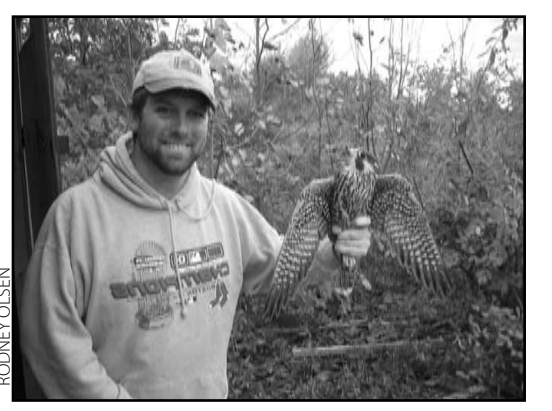
A juvenile peregrine falcon banded in 2005 at Deer Leap in Bristol was caught at a banding station at the Dead Creek Wildlife Management Area in Addison, VT in October 2005.

Six sites fledged four young each. Seventeen nestlings were banded at a total of six sites.