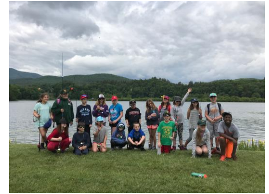
Fourth Graders fishing for pan fish in Windsor

Stafford Technical Center Forestry Program Educator