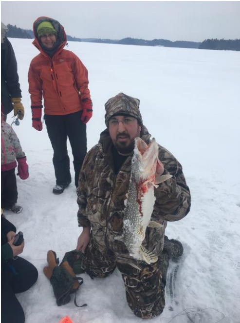
Ice fishing on Shelburne Pond.