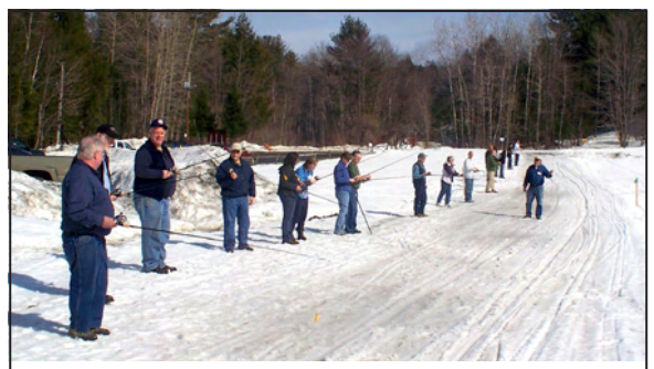
Learning to instruct others on spin casting.