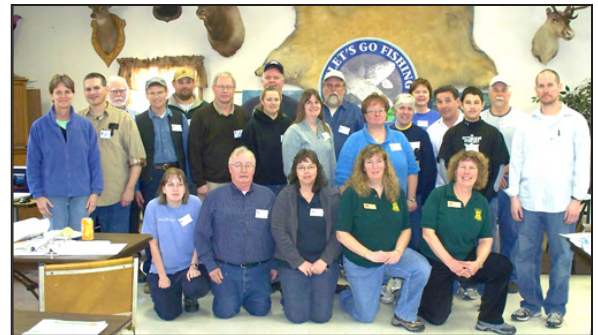
2009 Instructor's Training participants.