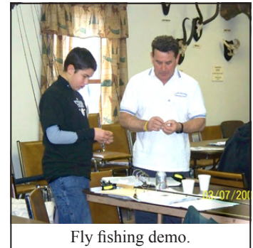
Fly fishing demo.