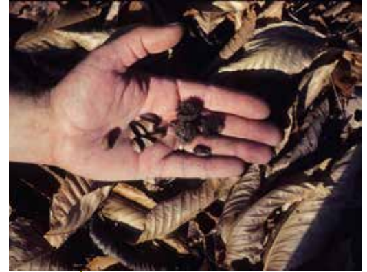
Figure 9.1 Beech trees are essential mast producers.

In a mast production area the most mast is produced by dominant and co-dominant American beech trees, and some trees are much more prolific than others. Evidence of feeding by bears (claw scars on the bark, clusters of broken limbs pulled into a feeding “nest” in the fall) indicates the most prolific, consistent mast producers. Mast production begins when beech trees are about 10 inches in diameter at breast height (DBH). Forest management decisions aimed at maintaining or increasing mast production will focus on larger beech, as well as beech 6- to 10-inch DBH because of their potential for mast production or resistance or tolerance to Beech Bark Disease (BBD). Beech stand management decisions should be made in the summer, as crown condition is an excellent indicator of tree vigor and capacity to produce beech nuts. When greater than 10 percent of the crown of beech trees stressed by BBD turns yellow by midsummer, the tree has an elevated risk for mortality. When more than 50 percent of the crown is yellow and/or has died, the tree has more than a 50 percent chance of dying within a few years. Bark condition is an indicator of the tree’s level of resistance or tolerance of BBD infection.