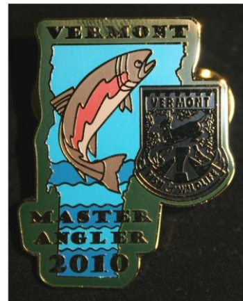
The 2010 Vermont Master Angler lapel pin

Chain Pickerel – Lake Champlain Largemouth Bass – Lake Champlain Pumpkinseed Sunfish – Lake Champlain Rock Bass – Lake Champlain Smallmouth Bass – Lake Champlain