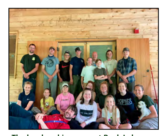
The hardworking crew at Buck Lake.

Yet again, a hardworking group found their way to Buck Lake in rainy May. We managed to accomplish all of the cleaning, painting, and groundswork while sneaking in some time near the fire playing games and chatting in the evening.