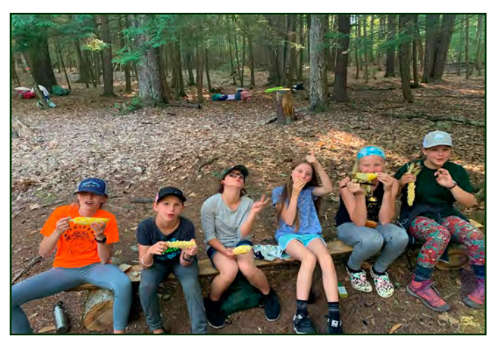
Campers enjoy fireside corn.

As we wrap up another year at GMCC, I find myself once again reflecting on what makes this camp so special. For a while, I thought it was the location. The forests of Buck Lake and the meadows of Kehoe have always called to me, as I'm sure they do many others. After spending last summer in those two beautiful places alone, I realized this simply was not the case. We are fortunate enough to hold our program in two exquisite places, but it is not the location that is important. It is the fact that it is a place filled with people. Campers who attend year after year, from different backgrounds and across generations. Staff members who come from across the country during a global pandemic to passionately and eagerly share their skills and knowledge. Junior Counselors, our dedicated high