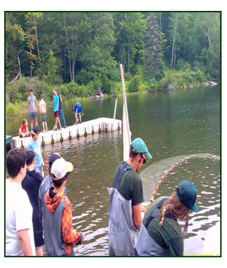
Campers get to seine net fish at Buck Lake during a fisheries biologist visit.