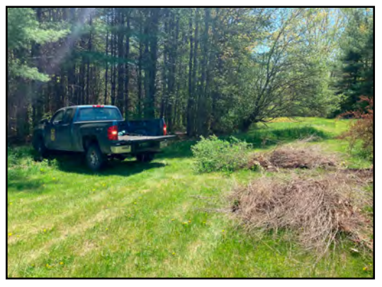
Invasive honeysuckle removal.