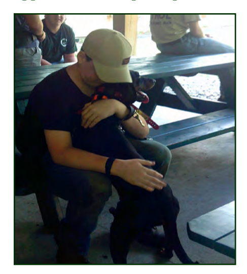
The Vermont Bearhound Association not only sponsors many campers, but members of BHA also visit camp with their bearhounds and teach about their value in wildlife management.

Everything is fun at GMCC. Hands-on activities are centered on educational topics such as forestry, wildlife biology, aquatic ecology, and more. Focused knowledge and skill development, like hunter education, and soft skill training, like teamwork during canoeing, are all a planned part of the week. The opportunities help campers make wonderful memories of hardwork mixed with a lot of laughter.