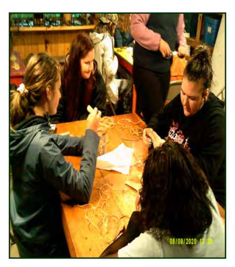
Bee house construction as part of a lesson about the value of pollinators during a girls session at Buck Lake.