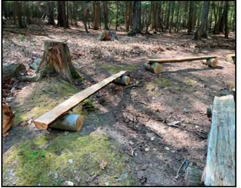
Benches at the Kehoe overnight site.

Firewood, wildlife garden weeding, fishing pole repair, painting, and cleaning are always on the to-do list during the Kehoe work weekend. This year also included new benches at the overnight camp site and much-needed repairs to the female staff cabin stairs and door. Despite the long list of tasks, volunteers and staff always have smiles on their faces and are happy to steal time in the evening and early morning to go fishing, birding, turkey hunting, or just take in the gorgeous view of Lake Bomoseen.