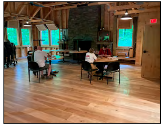
The tired workers taking a break to play games.