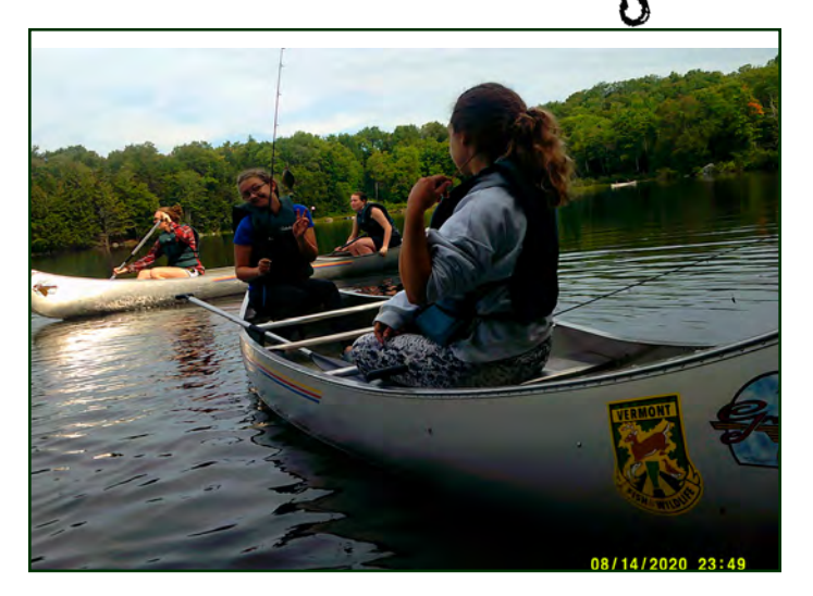
Canoe fishing at Buck Lake.

In addition to hiking, camping, and canoeing, a portion of the curriculum is focused on the Let's Go Fishing Program. Campers are introduced to a wide range of fishing techniques, and often have the opportunity to catch their first fish while at GMCC! We also find that some kids thrive when they get a chance to make a craft or show their creative side. That becomes evident during the fly tying lessons when kids get so excited about the fly they tied. And, they are even more enthusiastic about going fishing with their new creation. Fishing is also a relaxing activity that allows kids to just cast a line and be calm for a few minutes while chatting with their new camp friends.