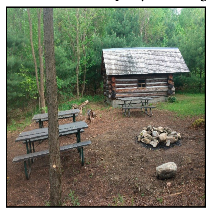
New Trapping Education Area

The bathhouse is set to be remodeled this fall. By May 2018 the project will be completed, and campers will arrive to find an updated bath facility with updated ventilation, epoxy flooring, and more!