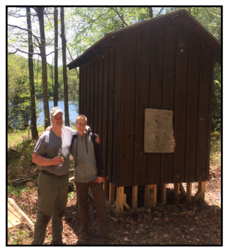
Fishing shed upgrade

Fourteen voluteers helped at Buck Lake, many of whom stayed overnight in the cabins, despite two very chilly nights of sleep! Several hazardous trees were removed with the help of a professional arborist; the fishing shed was revamped with a new floor and side boards; a new roof was put on the archery shed; and, roof holes were patched on the male staff cabin. Many other important projects, such as deep-cleaning cabins and the bathhouse, raking, moving picnic tables and archery targets, installing electric signs, lights, and AEDs, and cleaning up the grounds were accomplished with volunteers.