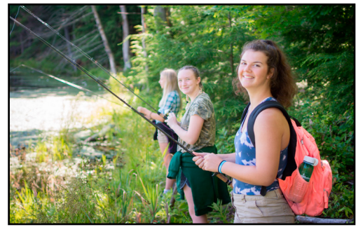
Fishing during an advanced week hike.

All campers participate in the Let's Go Fishing Program. This includes fishing, but there is more to fishing than simply casting a line. GMCC staff attend a training every spring to teach the campers about ecology, knot tying, ethics, regulations, tackle, and fly casting. These topics are covered before the campers wet a line.