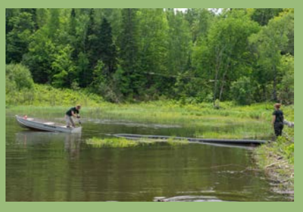
Top: Tyler Brown and Bree Furfey install a beaver baffle. Below: Tyler Brown installs a beaver exclusion fences.

The Beaver Baffle Project is funded largely by a US Fish and Wildlife Service grant and funds from the Vermont State Duck Stamp. More information can be found here: https://vtfishandwildlife.com/beavers