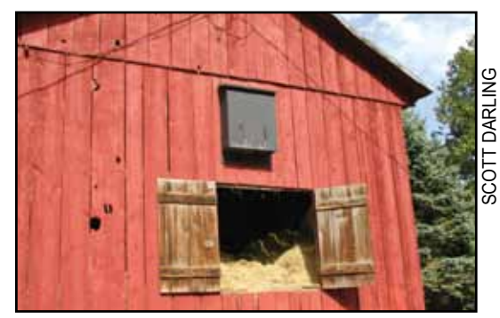
Place bat houses in a sunny location, like this house located above the hay loft door.

Vermont bat houses should receive at least eight to ten hours of direct sunlight per day. Houses