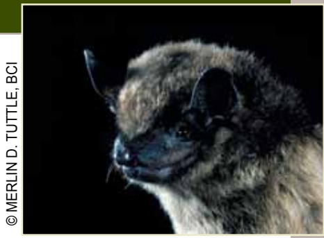
Big Brown Bat

should be oriented to face a southerly direction,