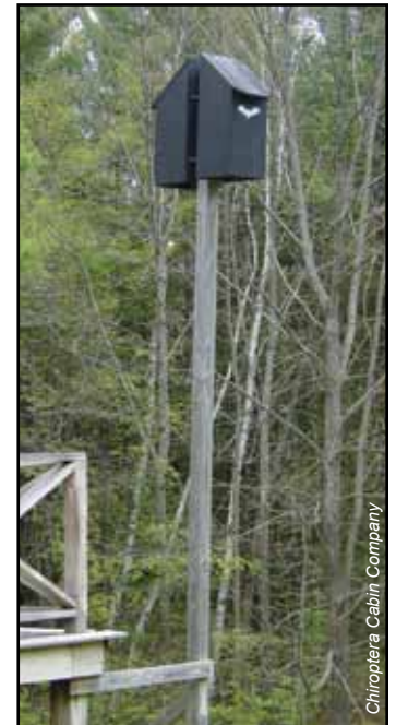
Chiroptera Cabin Company

✈ Be sure to place the house where it will receive at least eight hours of sunlight.