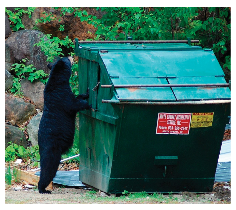
Dumpsters should have signage warning users about bears and listing how to properly use dumpsters.