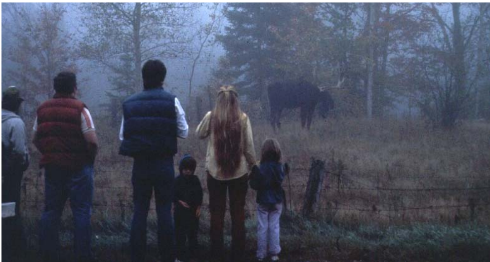
Moose watching has become a popular pastime in Vermont. Please keep a respectful distance.

Fish Buck Lake contains smallmouth bass, yellow perch, brown bullhead and brook trout.