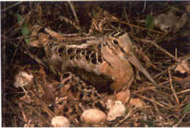
American woodcock can be found on East Hill.

East Hill Wildlife Management Area (WMA) is located in the north central Vermont town of Wolcott. The WMA is approximately 962 acres in size, however only 452 of those acres are owned by the State of Vermont in fee simple (total ownership). The State of Vermont owns hunting rights only for the remaining 706 acres. The Vermont Fish & Wildlife Department manages 256 acres to the southeast of Wolcott Pond and the Vermont Department of Environmental Conservation (formerly Water Resources) manages approximately 196 acres south and east of Wolcott Pond. Wolcott Pond Access Area, managed by the Vermont Fish & Wildlife Department, is associated with the WMA and provides access to Wolcott Pond for fishing opportunities. Access to the WMA is from Route 15 and East Hill Road east of the Village of Wolcott. Developed parking lots exist on (Oral) Marsh Road before the intersection of Lafont/Simmons Road, as well as at the Wolcott Pond boating access area.