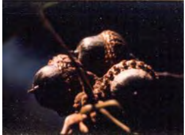
Acorns provide food for bears and many other species.

The property is completely forested with northern hardwoods such as sugar maple, yellow birch and beech, as well as a large red oak component. Of the 627-acre WMA, approximately 200 acres have red oak as the principle overstory species. Due to the concentration of red oak, this area is an important feeding area for a variety of wildlife species, particularly black bears.