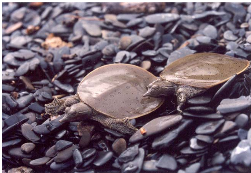
Young spiny softshell turtles begin their lives by crawling to water from their nest.

Fish Northern pike are a particularly important game fish that spawns here. There is good fishing also for walleye, large and smallmouth bass, perch, bullhead, carp, crappie and other warmwater fish just offshore from the WMA.