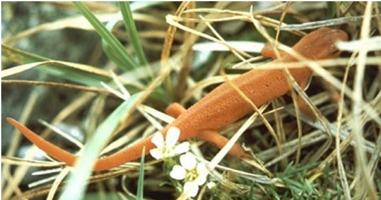
A red eft crawls along the forest floor.

Fish There are brook trout in Elm Brook.