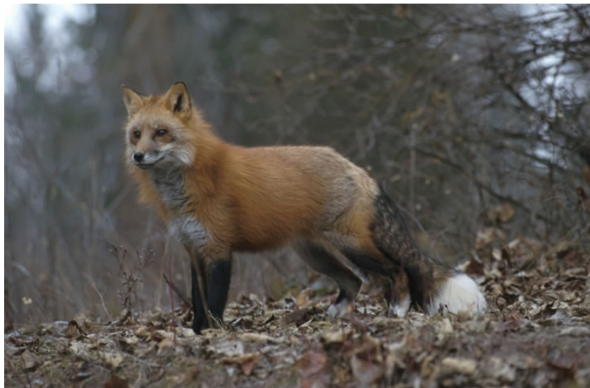
Red foxes are adaptable and utilize a variety of habitats.

Fish There are no fishable waters on this WMA.