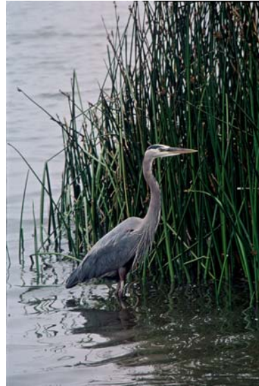
Great blue herons are Vermont's most common herons.

Mammals All the Vermont wetland mammal species can be found here, including beaver, muskrat, otter and mink. There are probably also smaller wetland-dwelling mammals such as long-tailed weasels and star-nosed moles. Game species on the uplands are white-tailed deer and cottontail rabbit. Upland furbearers would include red fox and coyote.