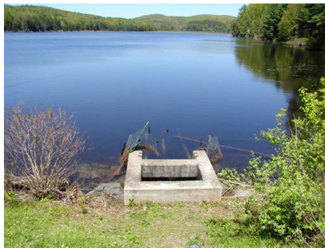
Looking north at Loves Marsh.

Fish Loves Marsh is a warmwater fishery that supports several species of fish including largemouth and rock bass, bullhead, northern pike, perch, sunfish and golden shiner.