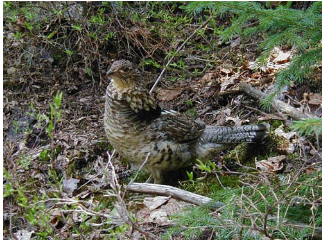
Ruffed grouse may be hunted in season at Les Newell WMA.

Fish There are wild brook and rainbow trout in the WMA's streams and beaver ponds.