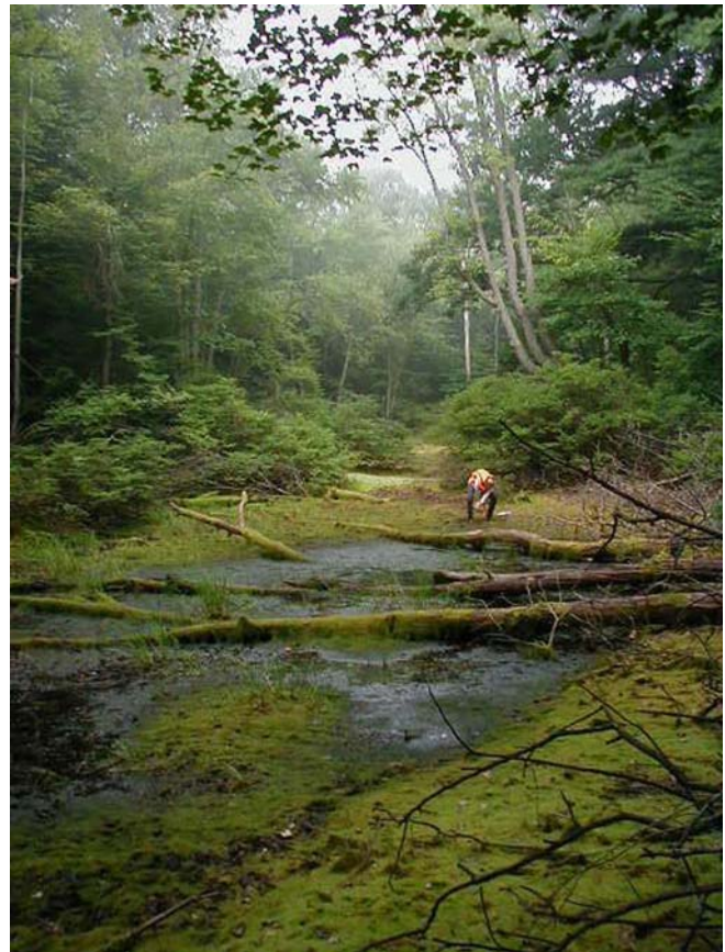
Sampling for amphibians in a vernal pool at Roaring Brook WMA.

Birds Turkey and ruffed grouse are present on the WMA and can be hunted in season. Wood ducks are another game species that may be found. Over 25 species of songbirds have been identified on the WMA. Visitors may also hear the loud call of the pileated woodpecker.