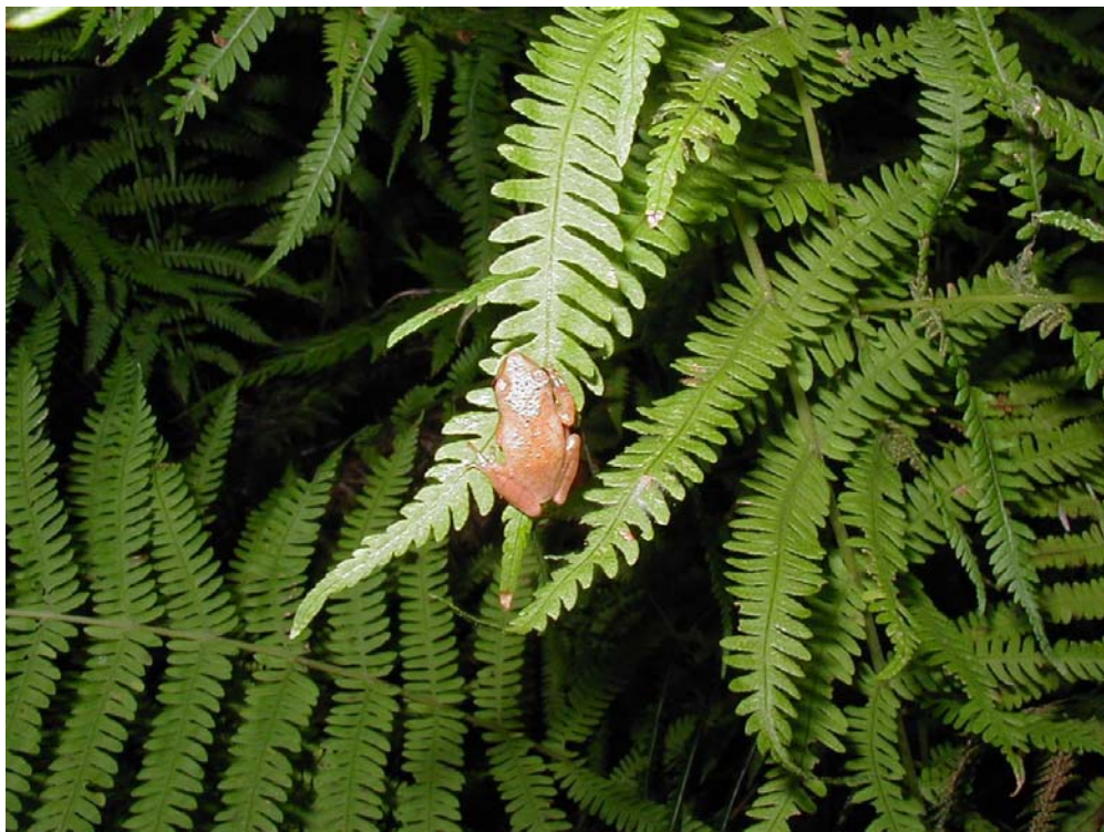
A spring peeper clings to a fern.

Fish There are no fishable waters on the WMA.