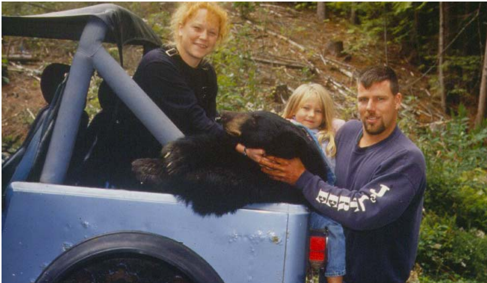
Black bear can be hunted at Calendar Brook and other wildlife management areas.

Fish Heavy shade provided by the forest canopy keeps Calendar Brook cold, providing good fishing for native brook trout in a remote (off-roadside) setting.