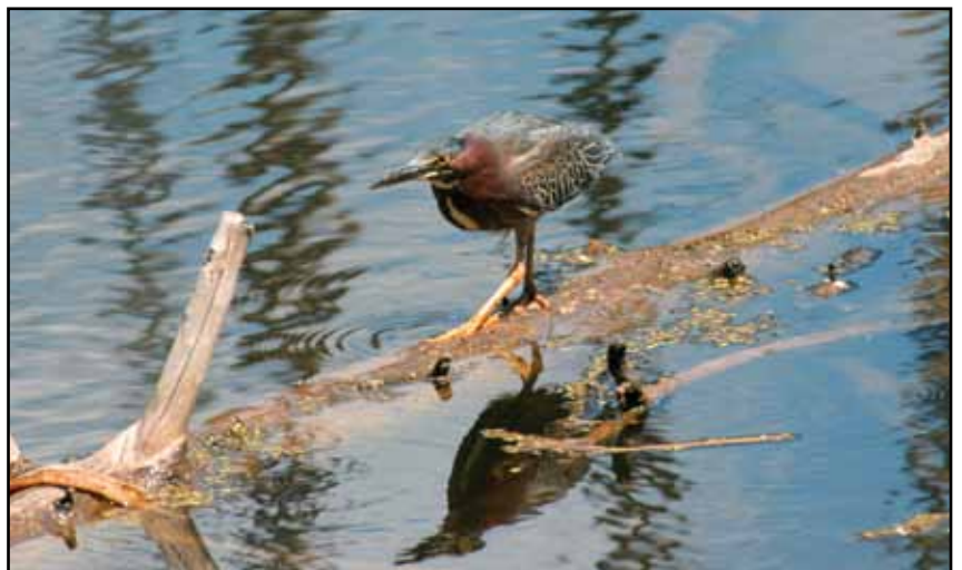
Eagle Point Wildlife Management Area (WMA) at Missisquoi National Wildlife Refuge provides excellent opportunities to see a variety of wetland and marsh species like green herons.

Planning for the future The US Fish and Wildlife Service and Vermont Fish & Wildlife Department will be developing a Long Range Management Plan for this property to be completed by December 2013.