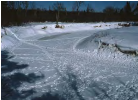
Deer tracks crossing the Nulhegan River.

The general character of the Wenlock WMA is boreal. The WMA lies at the southern edge of a vast basin drained by the main stem and four branches of the Nulhegan River. The northern portion of the WMA is fairly level and forested mainly with spruce and fir. It includes extensive wetlands. Elevations on the WMA are from 1,140 to 1,200 feet, with a few hardwood knolls and ridges rising to more than 1,400 feet.